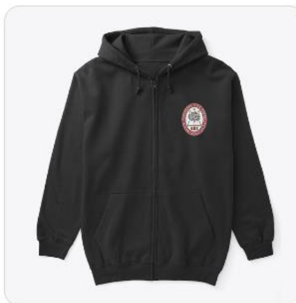
Southport High School Alumni Association $35.99