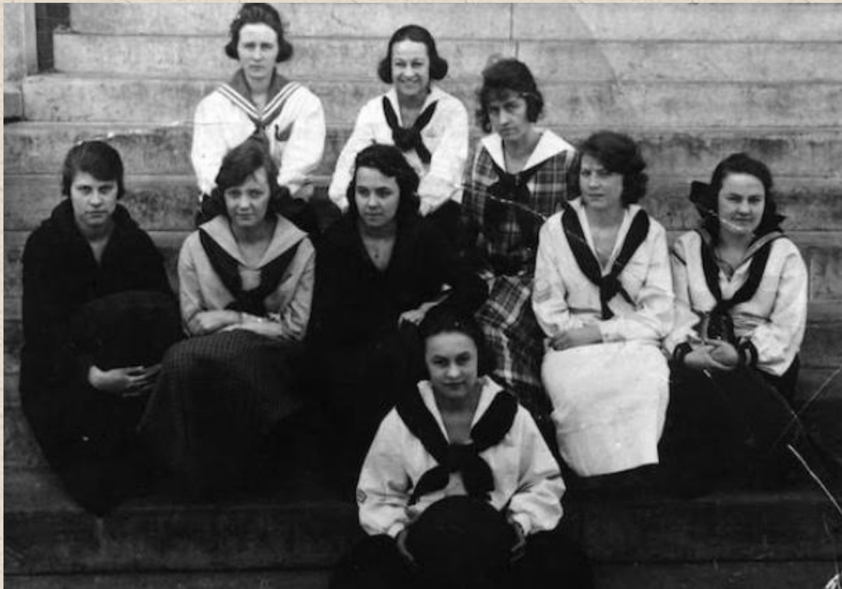
1919 Girls Basketball