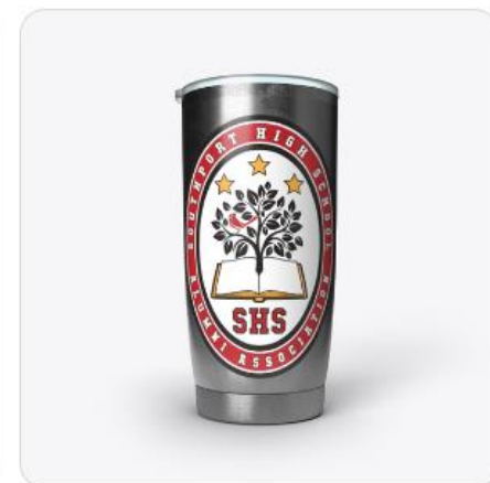
Southport High School Alumni Association $23.99