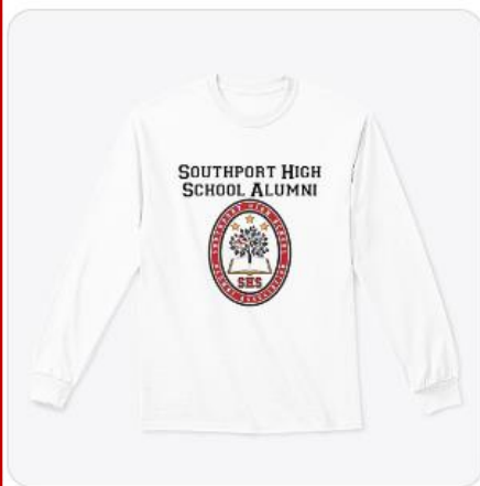
Southport High School Alumni Association $24.99

Looking for some SHS Alumni gear? Look no further. All proceeds from sales go to benefit SHSAA and current SHS students.