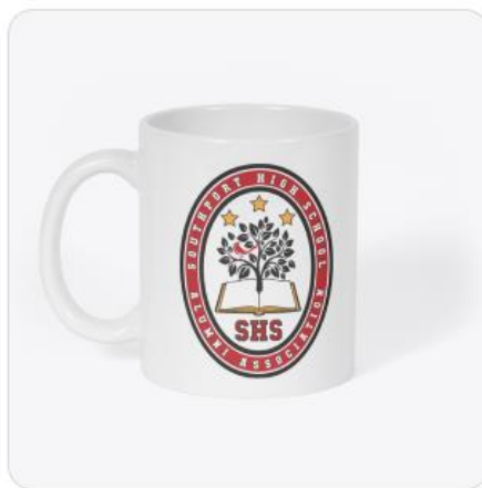
Southport High School Alumni Association $14.99