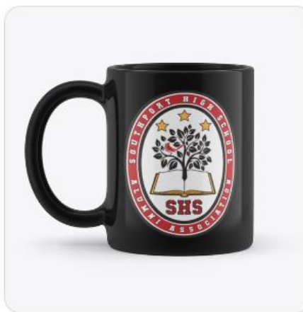
Southport High School Alumni Association $14.99