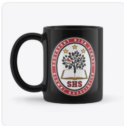
Southport High School Alumni Association $14.99