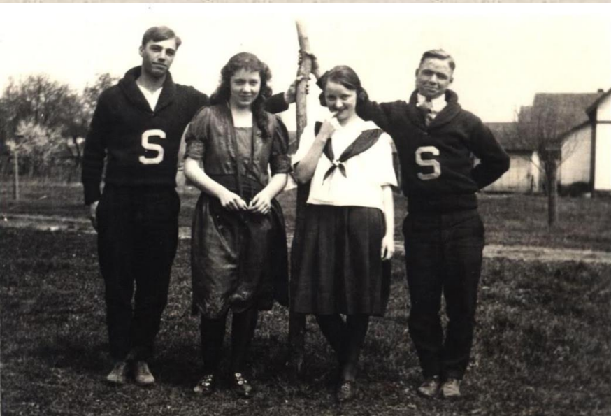
SHS Classmates 1922