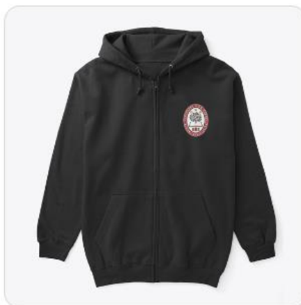
Southport High School Alumni Association $35.99