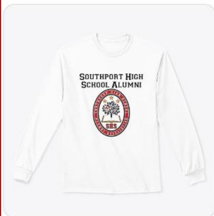
Southport High School Alumni Association $24.99

Looking for some SHS Alumni gear? Look no further. All proceeds from sales go to benefit SHSAA and current SHS students.