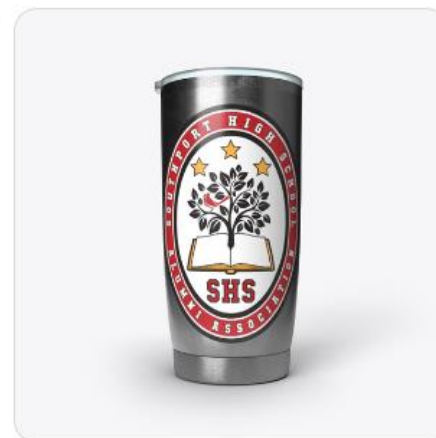
Southport High School Alumni Association $23.99