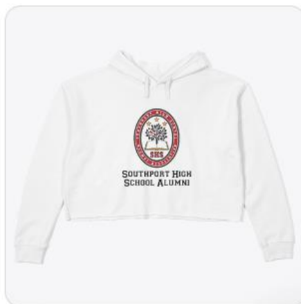
Southport High School Alumni Association $31.99