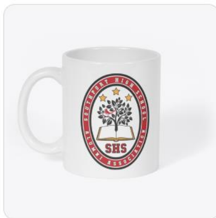
Southport High School Alumni Association $14.99