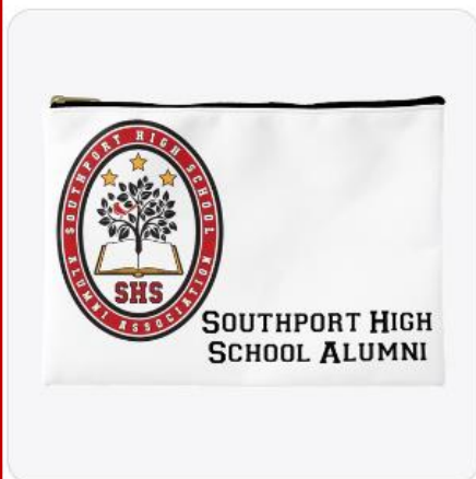
Southport High School Alumni Association $15.99