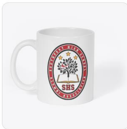
Southport High School Alumni Association