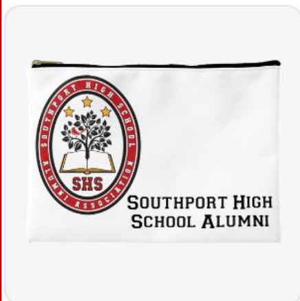
Southport High School Alumni Association