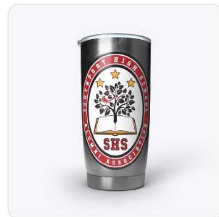
Southport High School Alumni Association