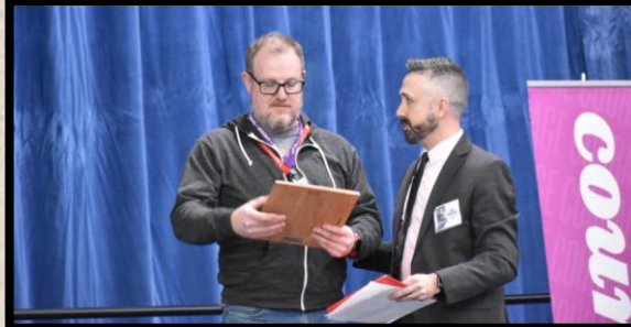
SHS Adviser Honored