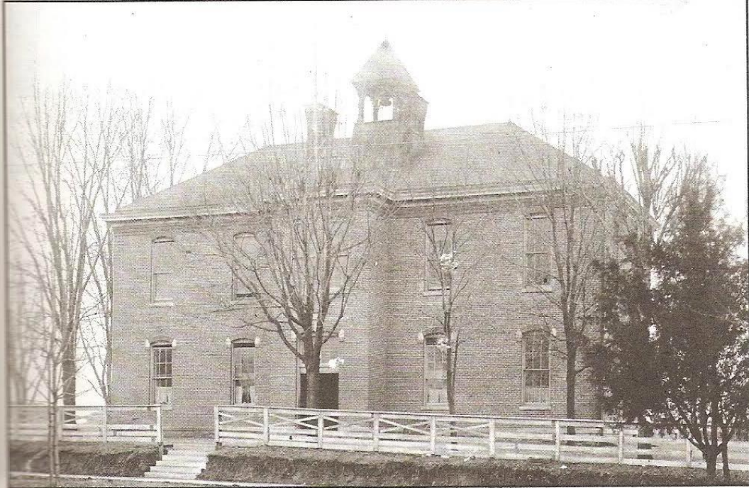
First Southport High School — Built in 1883 after tornado wrecked the frame building