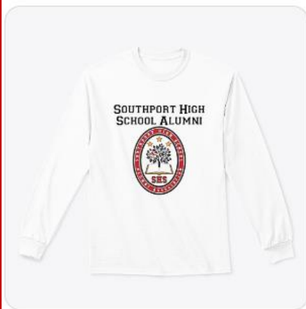
Southport High School Alumni Association

Looking for some SHS Alumni gear? Look no further. All proceeds from sales go to benefit SHSAA and current SHS students.