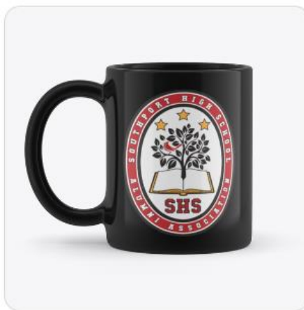
Southport High School Alumni Association