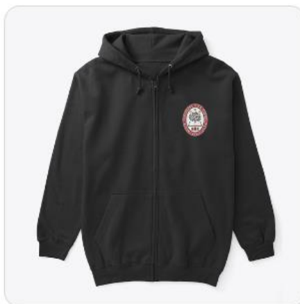
Southport High School Alumni Association