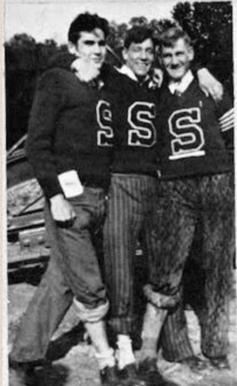
SHS Lettermen (1931)