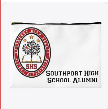
Southport High School Alumni Association