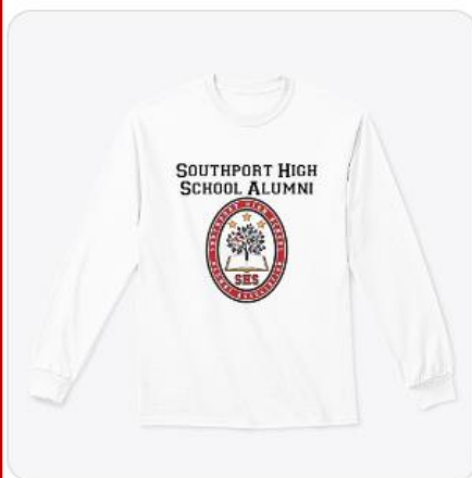
Southport High School Alumni Association

Looking for some SHS Alumni gear? Look no further. All proceeds from sales go to benefit SHSAA and current SHS students.