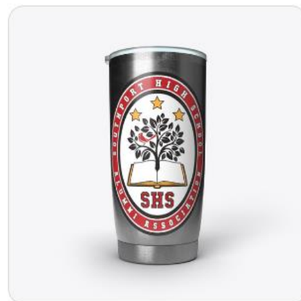
Southport High School Alumni Association