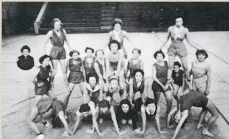
SHS Girls GAA (1936)