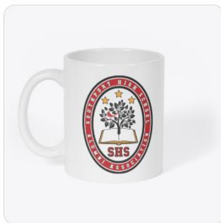
Southport High School Alumni Association