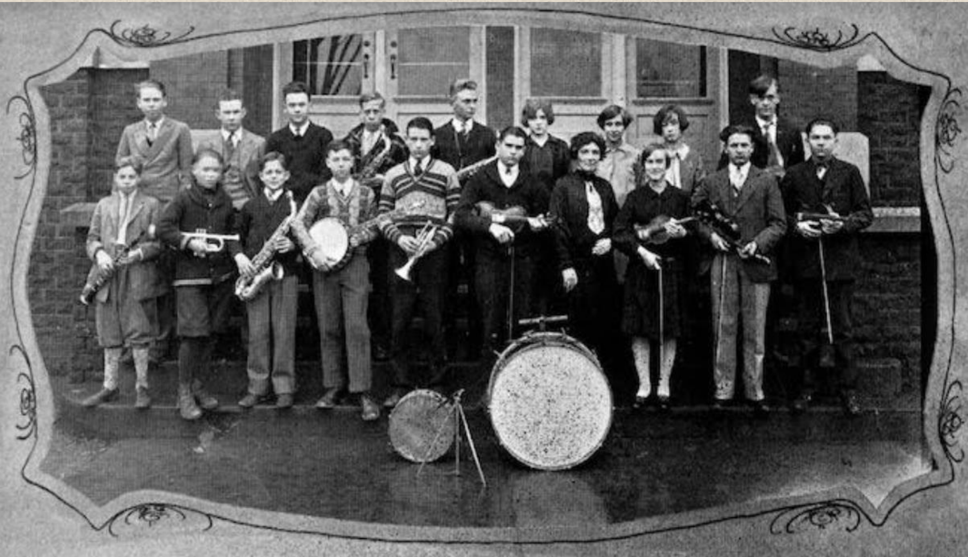
SHS Orchestra (1926)