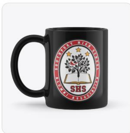
Southport High School Alumni Association