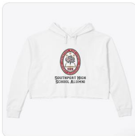
Southport High School Alumni Association