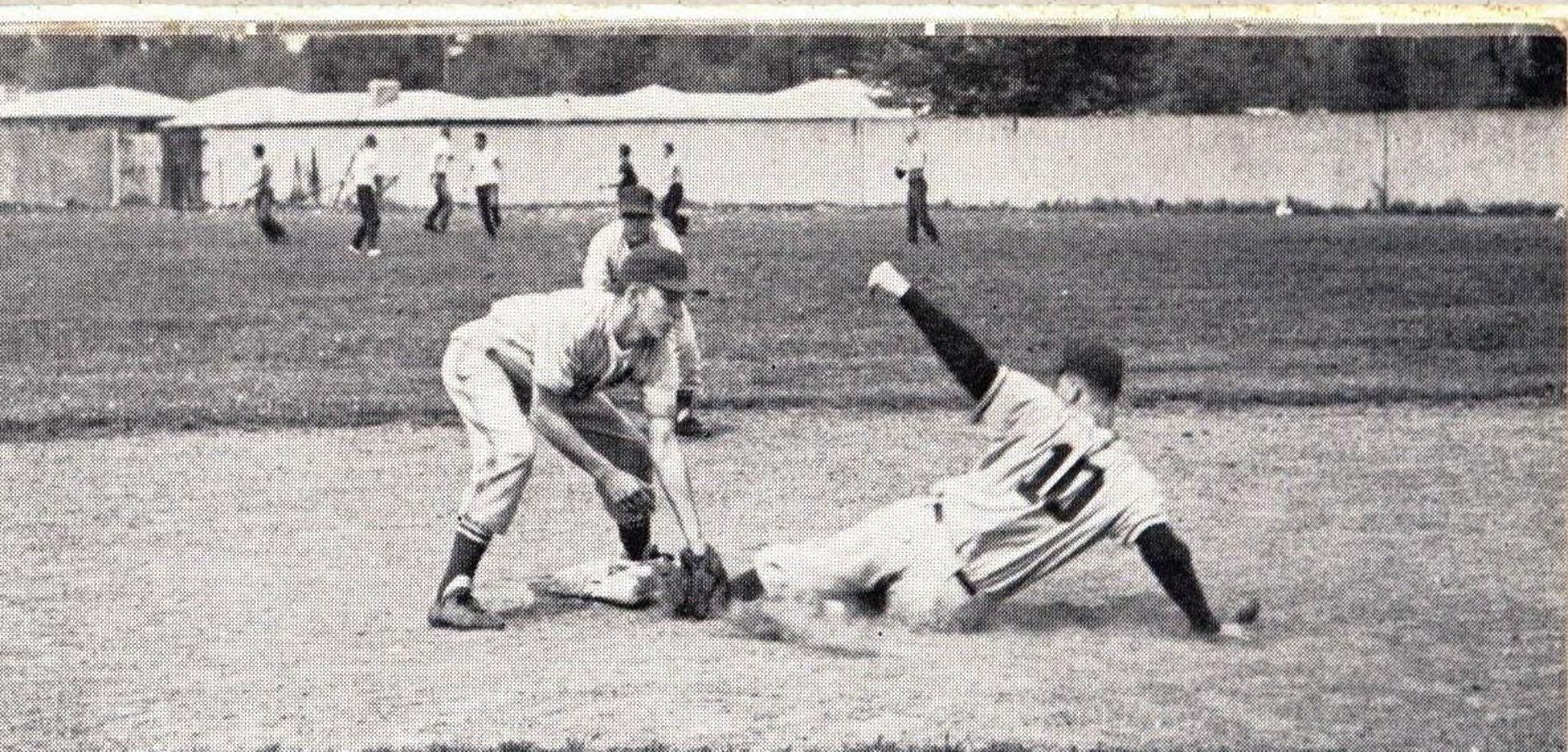
SHS Baseball – inside Roosevelt Stadium (1950s)