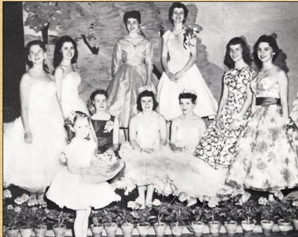
The Spring Dance (1950's) The Queen and Her Court