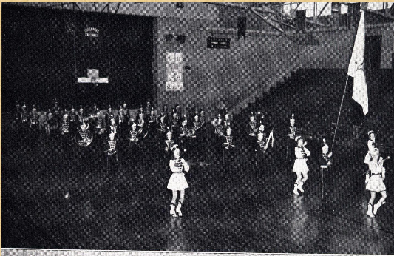
The 1939 Band performs in the old Southport High School gym.